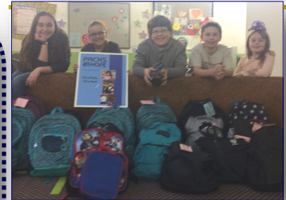
(Pictured above) NHS students collected Packs of Hope backpacks this December.