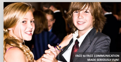
FACE to FACE COMMUNICATION MADE SERIOUSLY FUN!

Please see the cotillion flyer for more information.